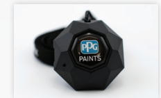
PPG Paints NIX App