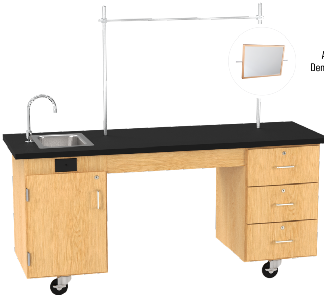
Add-on Demo Mirror!