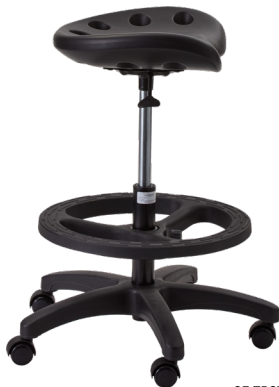
SE-TR2T W/Optional Casters