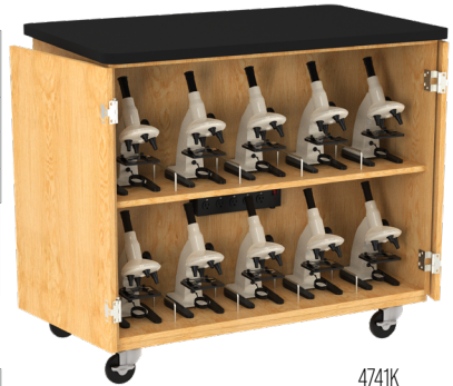
4741K (Microscopes not included)