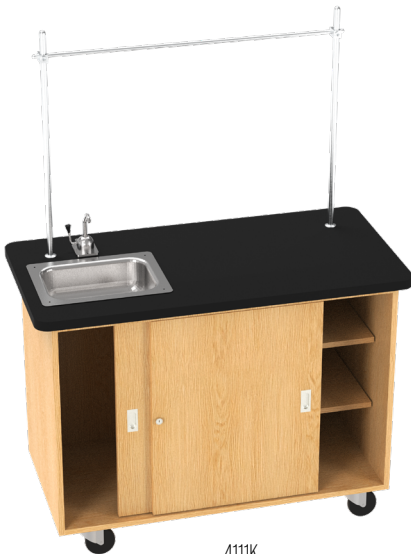
4111K Double Sliding Doors