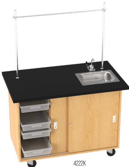
4222K Totes behind Double Sliding Doors