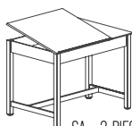
A = 1-PIECE TOP