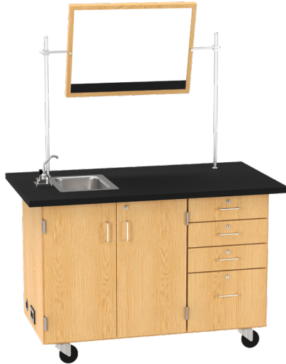
4342K 2 Doors & 4 Drawers with Mirror/Markerboard