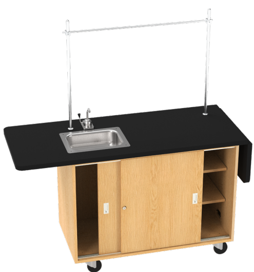
4121K Double Sliding Doors With Drop Leaf Extensions