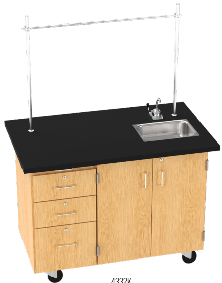
4332K 2 Doors & 3 Drawers